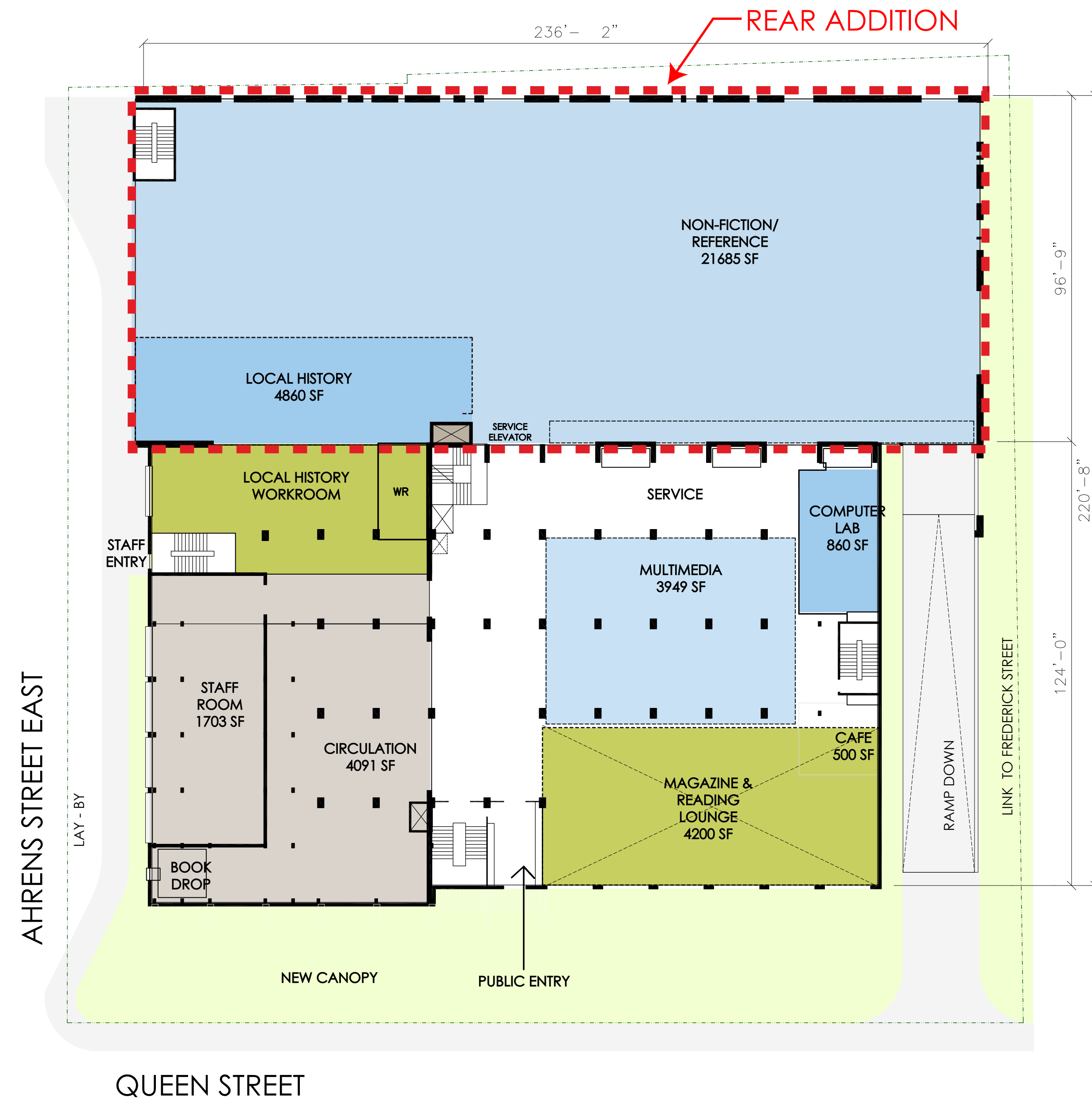
GROUND FLOOR 48,500 SF