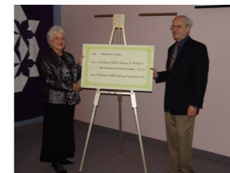
To support KPL services and collections the Foundation presented KPL with a cheque for $50,035.73 in December 2006. We thank our generous donors who made this possible.

This message is one of gratitude to you, a donor of the KPL Foundation.