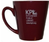
Funnel Mug $7

KPL now offers a variety of promotional items that are perfect for stocking stuffers.