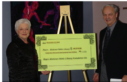
To support KPL services and collections to the Foundation presented KPL with a cheque for $44,074.66. We thank our generous donors who made this possible.

While the debate and decision continues on as to where the new Central Library should be located, the KPL Foundation, a separate entity, will continue to develop new initiatives as well as financial support for the