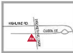
FOREST HEIGHTS LIBRARY 251 Fischer-Hallman Road 519-743-0644