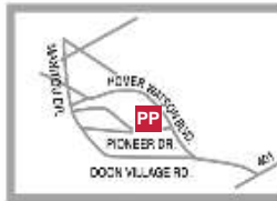
PIONEER PARK LIBRARY 150 Pioneer Drive 519-748-2740