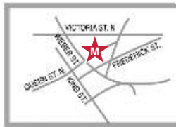
MAIN LIBRARY 85 Queen Street North 519-743-0271