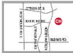
COUNTRY HILLS LIBRARY 1500 Block Line Road 519-743-3558

Parking Information Free parking is available at all our Community Libraries.