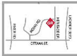
GRAND RIVER STANLEY PARK LIBRARY 175 Indian Road 519-896-1736